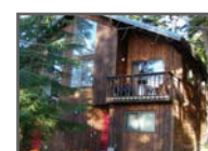
357 Crystal Mtn B5