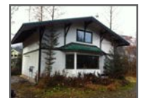
334 Timberline Drive