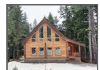
357 St. Johann Loop