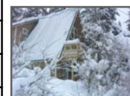
120 My Road