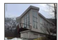
270 Alyeska View #C