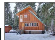
120 Bursiel Circle