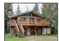
143 Alta Drive