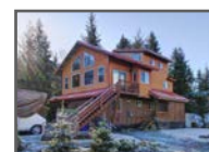
143 Alpina Way