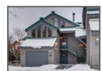
190 Snowy Ct. #1A