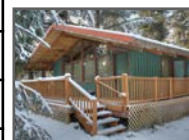
731 Alyeska View