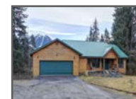
129 Mica's Meadow