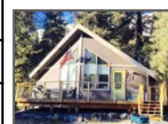
135 Birdhouse Lp