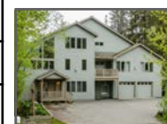
3004 Alyeska Hwy.