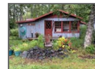
237 Main Street