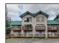
366 Crystal Mtn #612