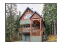
235 St. Johann Lp.