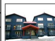
282 Crystal Mtn #104S, 111S