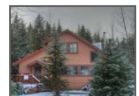
299 Alpina Way